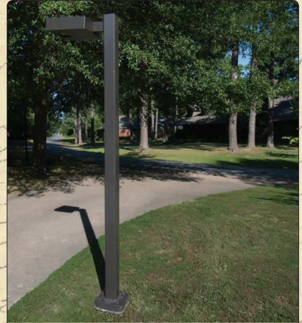
Solar lighting installed with a ground screw foundation is the ideal solution for retro-fit installations. There is no yard excavation for wiring or foundation, no waiting for concrete to cure and minimal clean-up with lower cost. All of which make for happy customers.