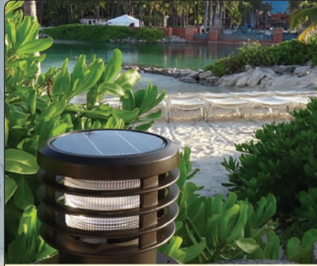
The WLB bollard provides a wide angle of light for area illumination. It is simply and quickly installed with our proven ground anchors.