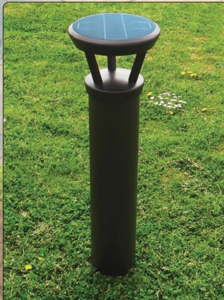
The PLB bollard points light downward to illuminate pathways, sidewalks, trails, ramps, and anywhere else dependable easy-to-install lighting is needed.